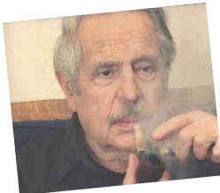
Haim Gouri, Winner of the Israel Prize for Poetry in 1988.

Co-sponsored with the Jewish, Islamic and Near Eastern Studies Program and the Asian and Near Eastern Languages and Literatures Department.