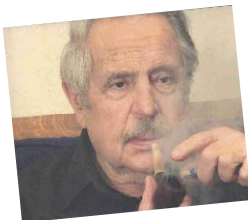
Haim Gouri, Winner of the Israel Prize for Poetry in 1988.

Co-sponsored with the Jewish, Islamic and Near Eastern Studies Program and the Asian and Near Eastern Languages and Literatures Department.